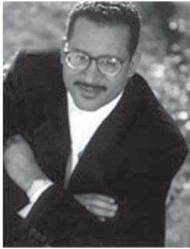
Michael Eric Dyson

The eleventh annual Institute on Black Life Research Conference ( Celebrating Community Empowerment, Engagement and Achievement ) was held April 13-14, 2006 at the Embassy Suites. The event was the fourth in a series of conferences focusing on issues affecting the Black Children and Families. The conference featured keynote speaker Dr. Michael Eric Dyson, an ordained Baptist minister, professor of Humanities at the University of Pennsylvania, and author of numerous books including, "Come Hell or High Water: Hurricane Katrina and Color of Disaster."